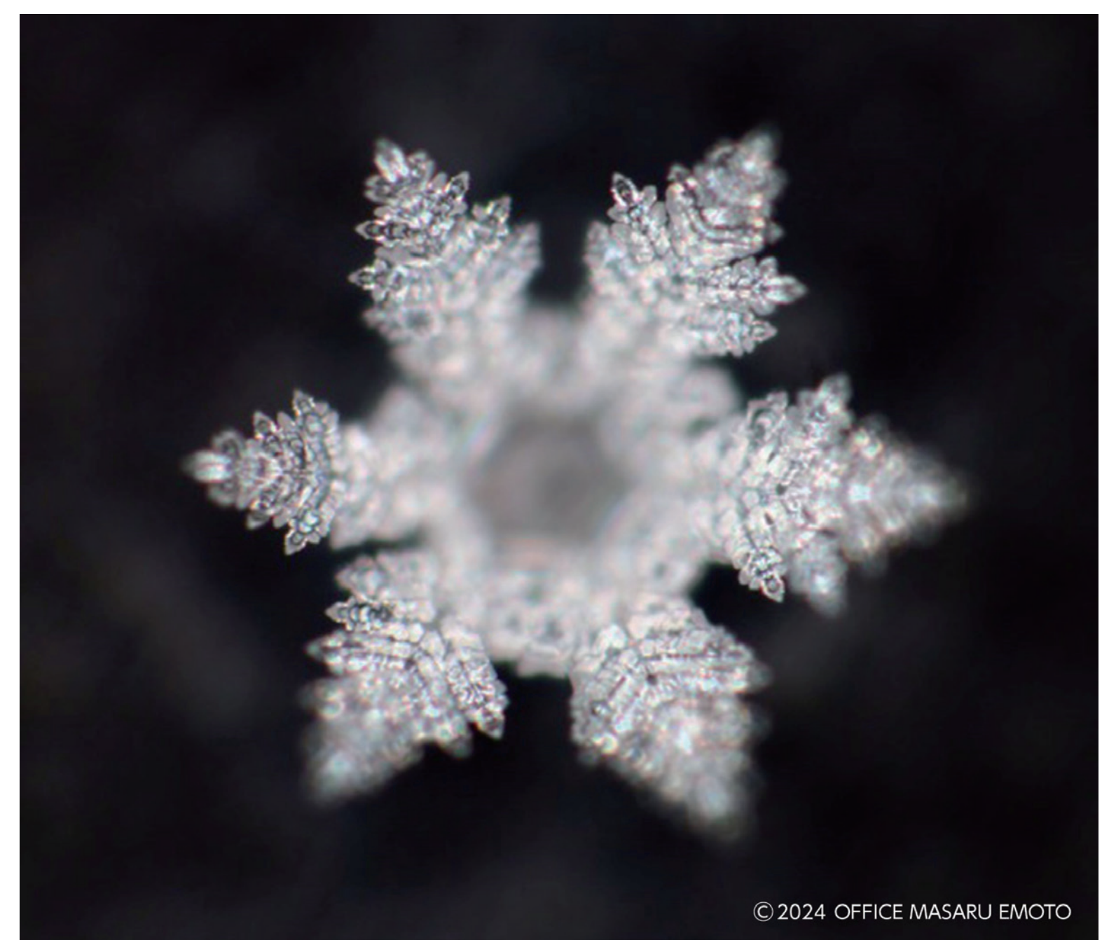
\pi -filtered water